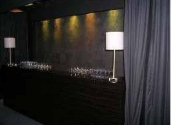
Tomford Fashion Show