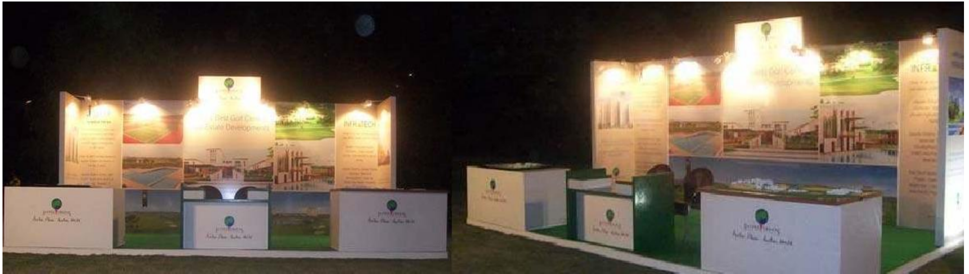
JP Green Show at Agra