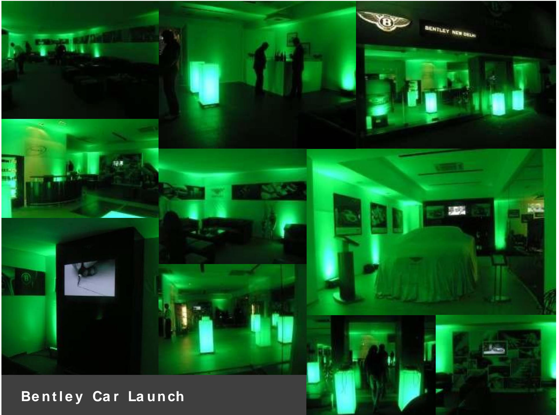
Bentley Car Launch