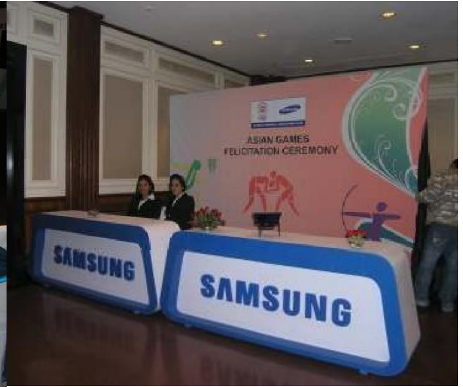
Samsung Press Conference