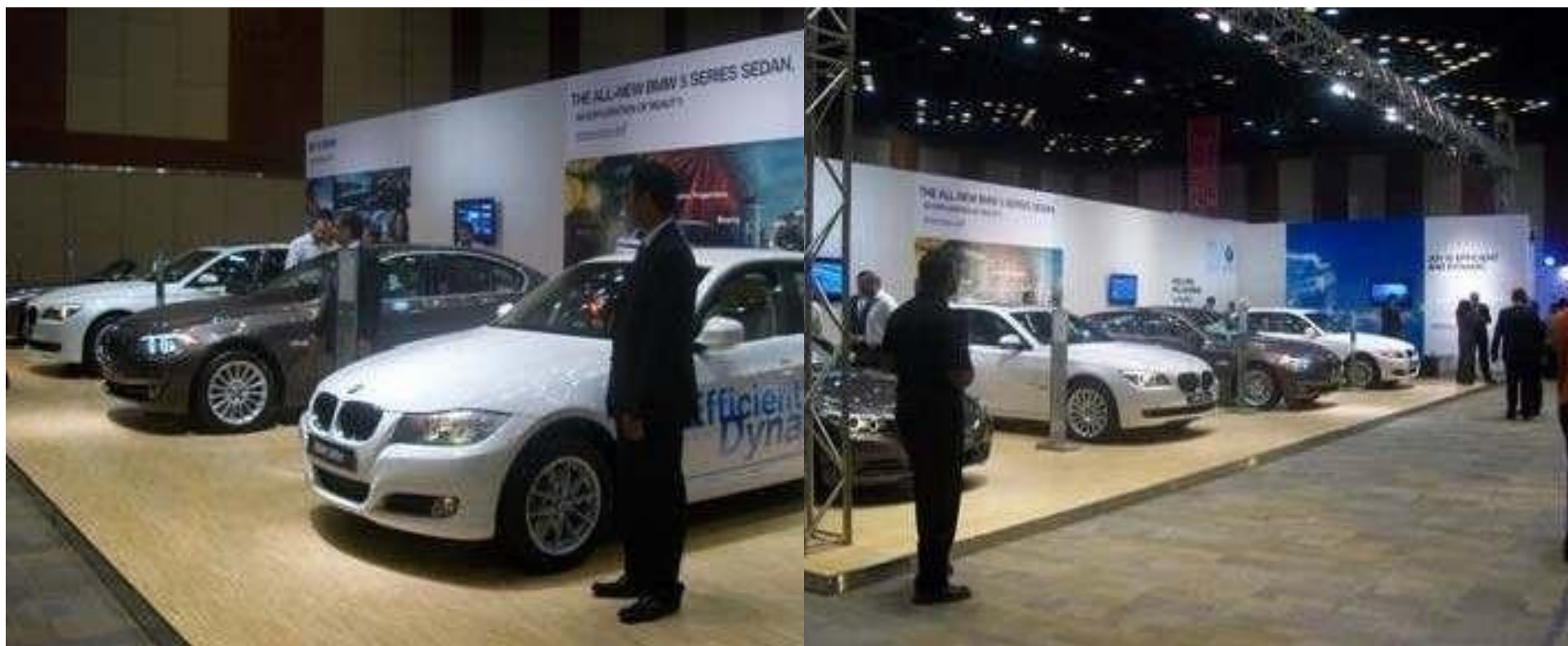
BMW Car Show @ Hyderabad