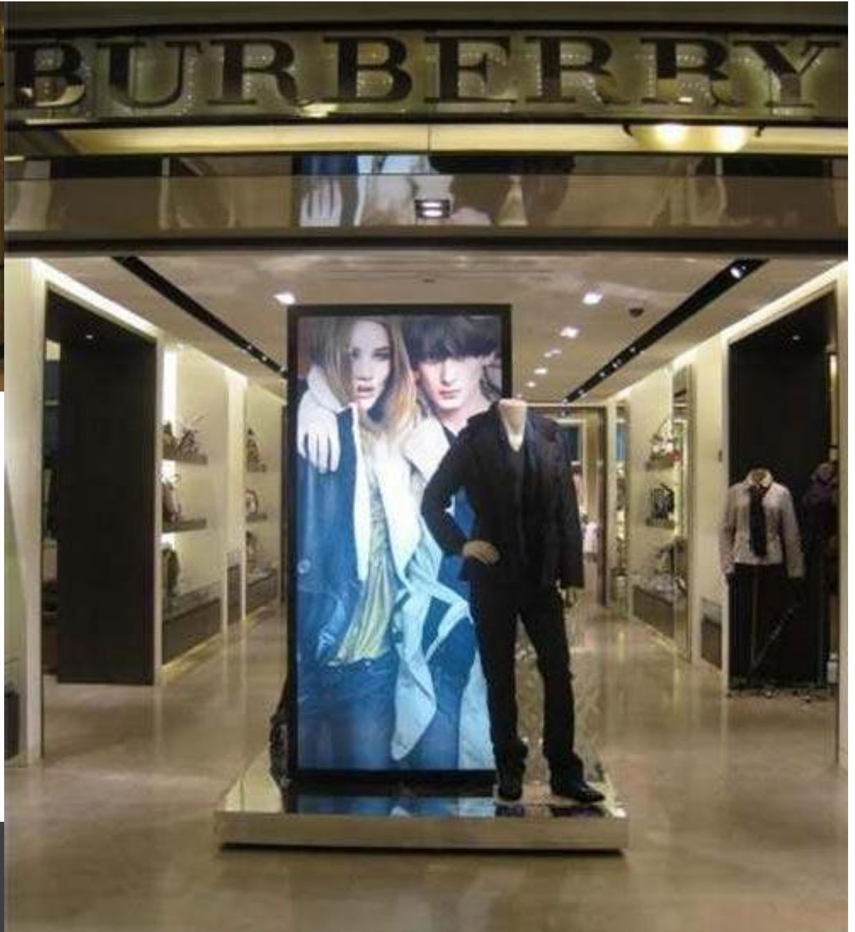
Burberry Window Display