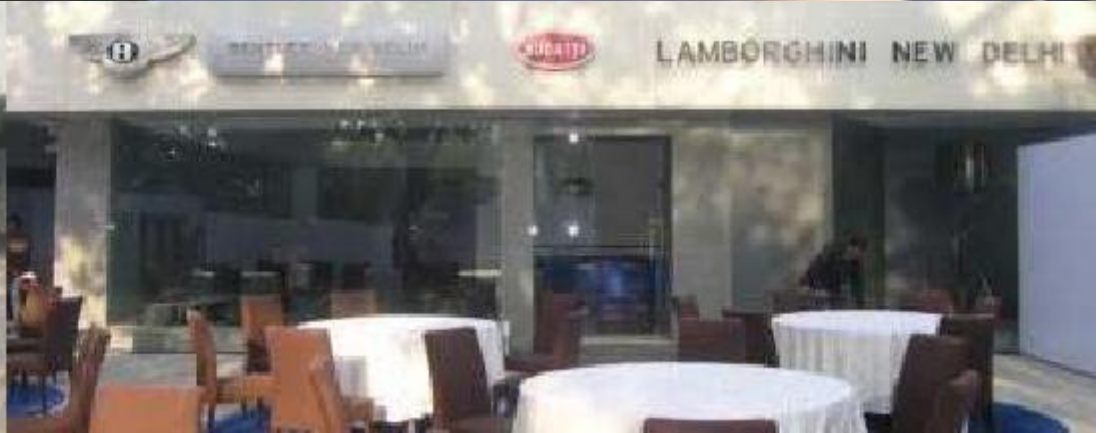
Bugatti Car Launch